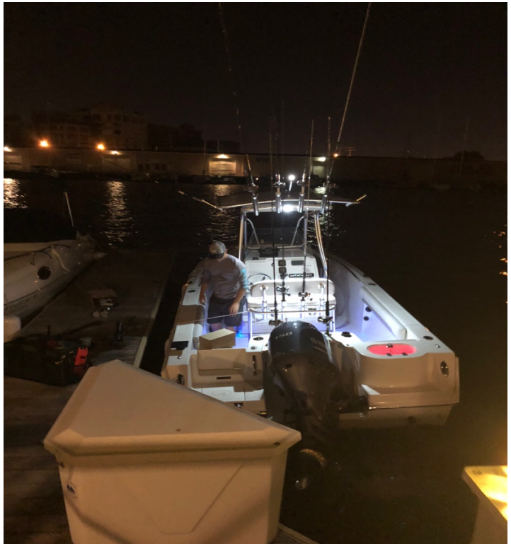
CareFree Boat Club 601 E Erie St, Milwaukee, WI, 53202